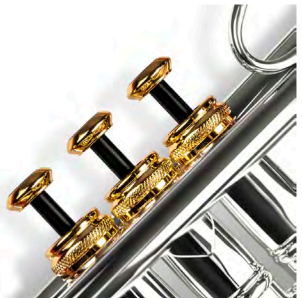
Black Onyx Trimkit for Bach and Yamaha bottom caps Light 9 mm, Medium 13 mm, or Heavy 20 mm