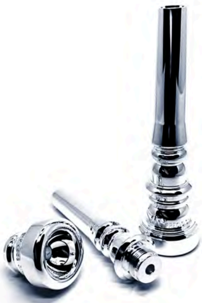
Natural model Baroque trumpet mouthpiece 7 cup diameters, 3 depths, 9 rim shapes, 4 backbores, and 3 throats available